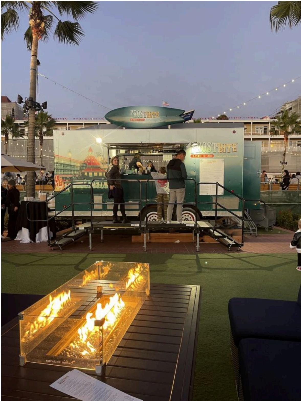
Dorothy Cascerceri Simone

Our first night there, we cozied up on plush outdoor couches with eggnog in hand at Frostbite Lounge with a crackling fire table to keep us warm. We had the clearest view in one direction of the majestic Coronado Beach sunset and the waves of the Pacific Ocean lapping at the shore,