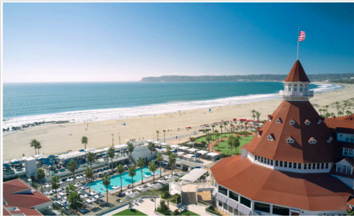
The Hotel del Coronado

With the uptick in travel, now is the time to map out your plans for the new calendar year – especially when it comes to one of the most popular times to jet set: the November and December holidays.